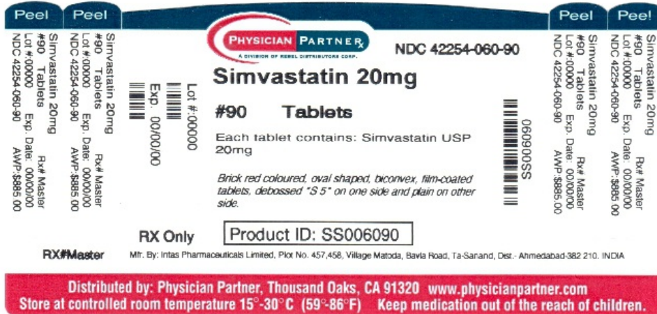
PRINCIPAL DISPLAY PANEL