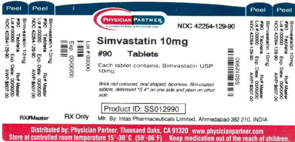
PRINCIPAL DISPLAY PANEL