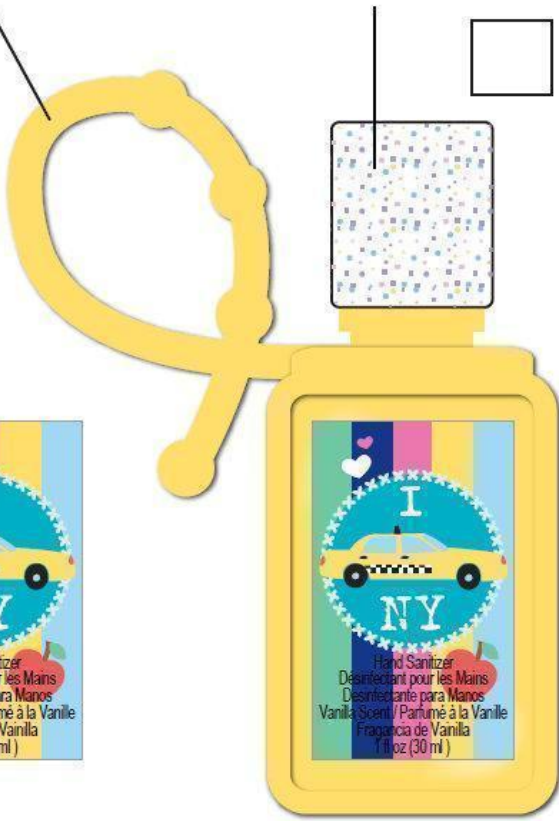
ANTI BAC - FRONT