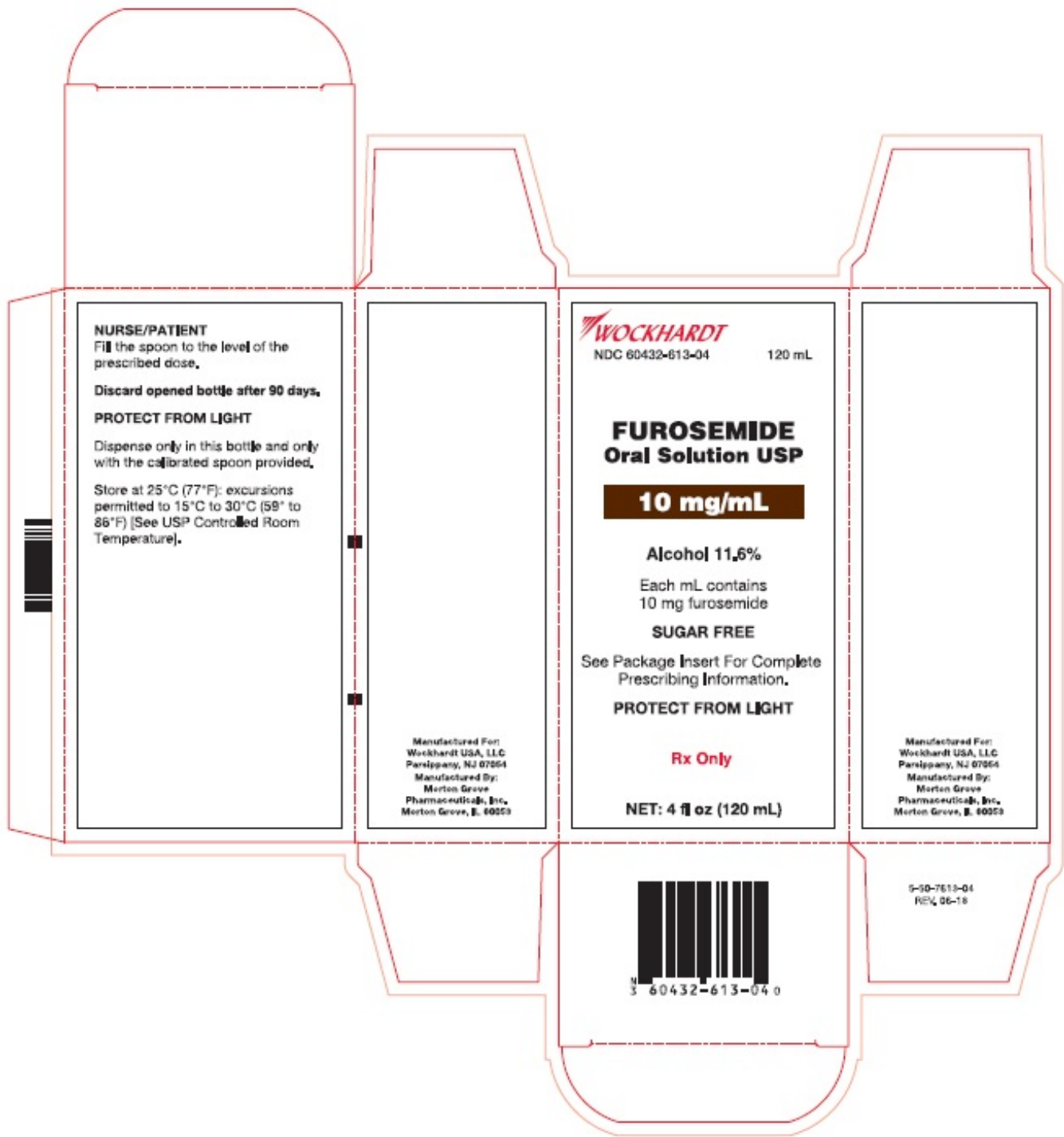
Furosemide Oral Solution Carton