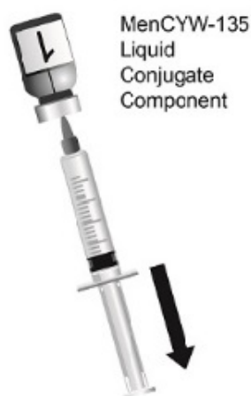
Figure 1. Cleanse both vial stoppers.

MENVEO is supplied in 2 vials that must be combined prior to administration. Use the MenCYW-135 liquid conjugate vaccine component (Vial 1) to reconstitute the MenA lyophilized conjugate vaccine component (Vial 2) to form MENVEO. Invert the vial and shake well until the vaccine is dissolved and then withdraw 0.5 mL of reconstituted product. Following reconstitution, the vaccine is a clear, colorless solution, free from visible foreign particles. Parenteral drug products should be inspected visually for particulate matter and discoloration prior to administration, whenever solution and container permit. If any of these conditions exist, MENVEO should not be administered.