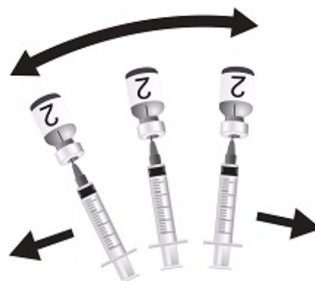
Figure 3. Invert the vial and shake well until powder is completely