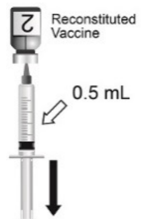
Figure 4. After reconstitution,