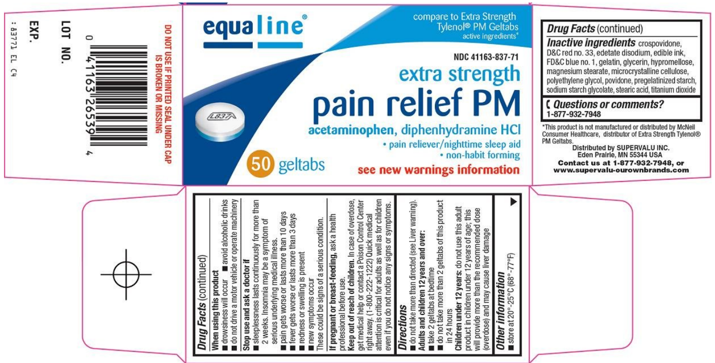
Pain Relief PM Carton Image 1