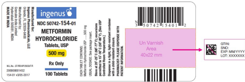
Bottle Label 500 mg - 100s Count