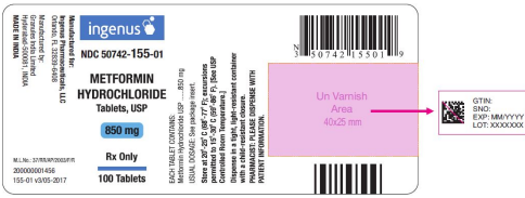
Bottle Label 850 mg - 100s Count