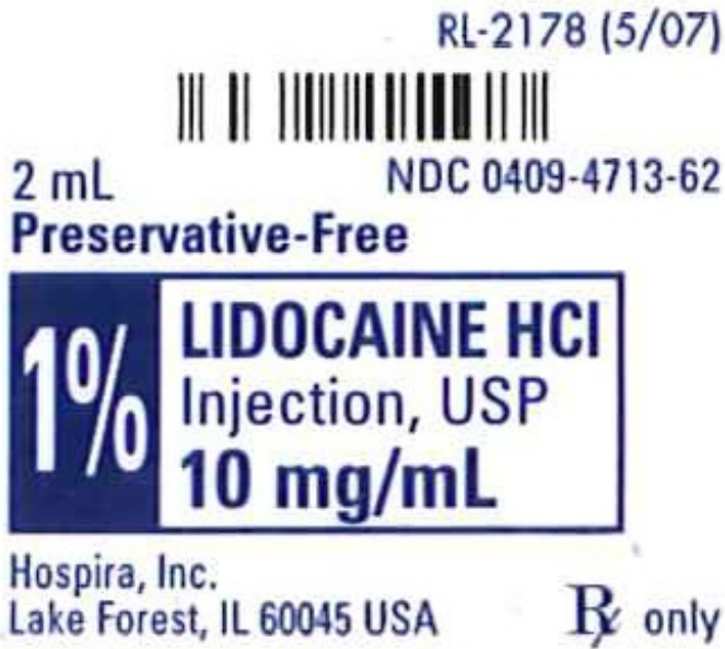
Package Label Display Panel