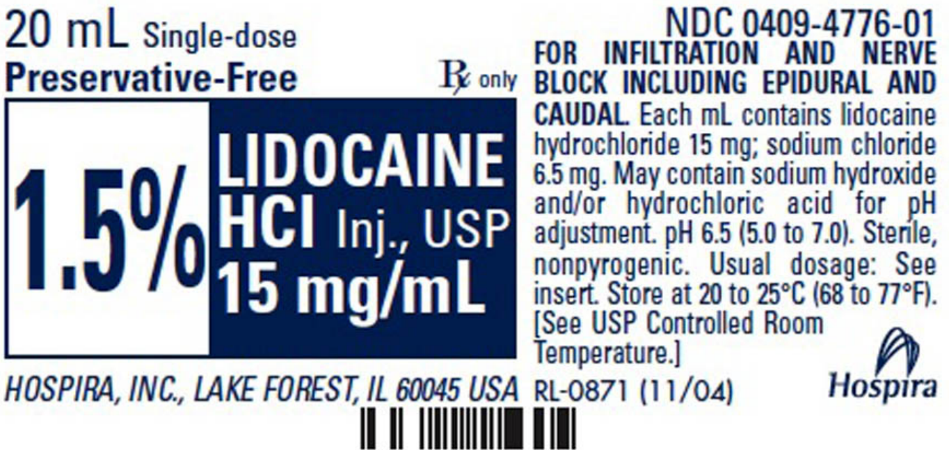
Package Label Display Panel