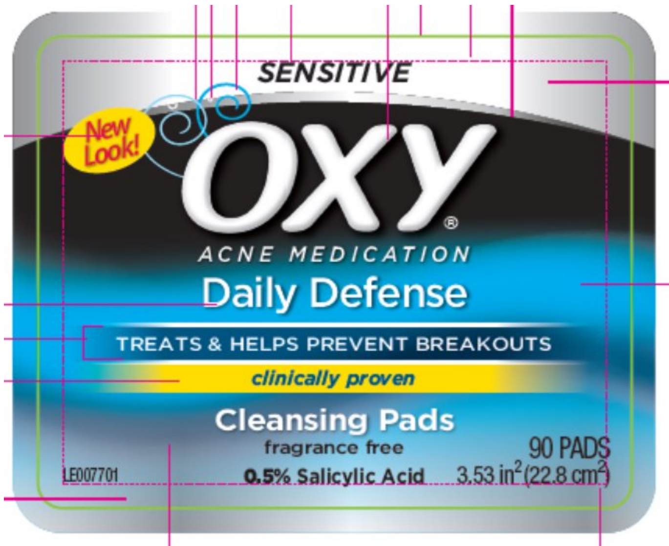
Principal Display Panel