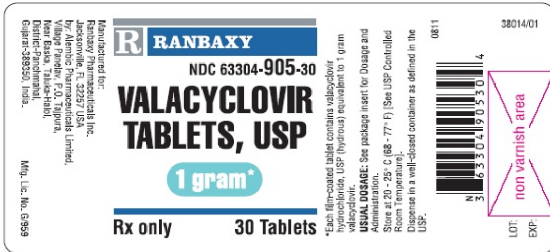
1 gram 30's Bottle Label (Manufactured by Alembic Pharmaceuticals Limited)