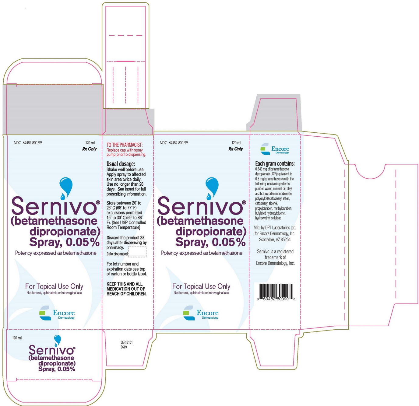
PRINCIPAL DISPLAY PANEL - NDC: 69482-800-99 - 120 mL Spray Bottle Label