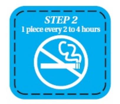
At the Beginning of Week #7