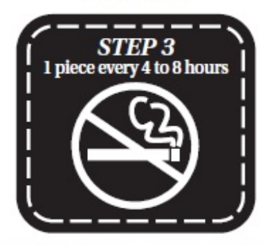
At the Beginning of Week #10