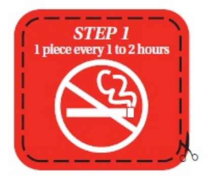
At the Beginning of Week #1 (Quit Date)