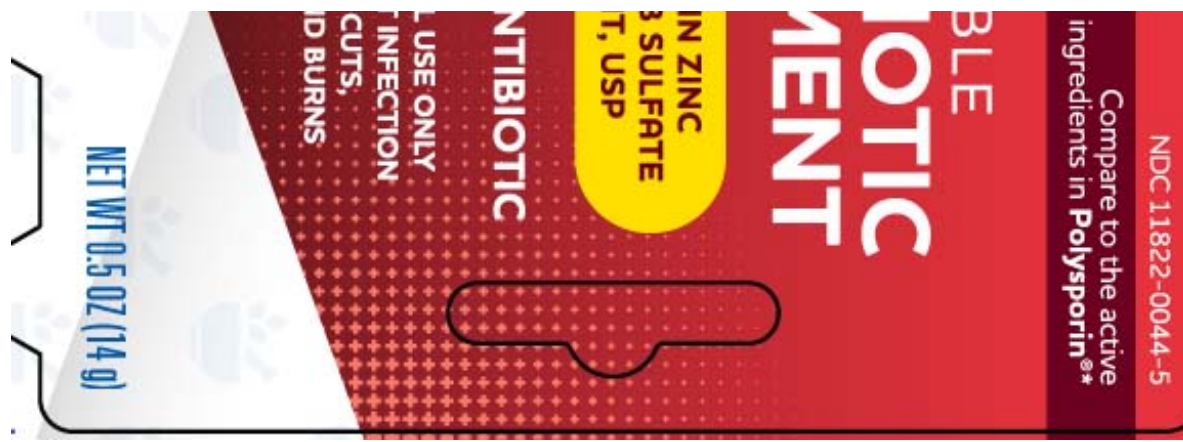
RITE AID Double Antibiotic Ointment