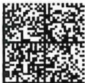
Mixed Vespid Venom Protein 5-Dose Carton Label

(01)00365044994556 (17)201101 (10)T0000442 (21)0000000001