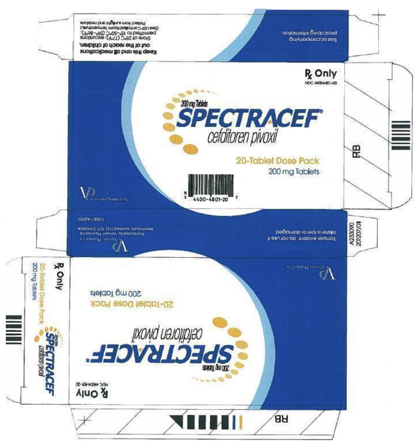
Spectracef 200 mg