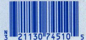
3. 32OZ: safeway32.jpg