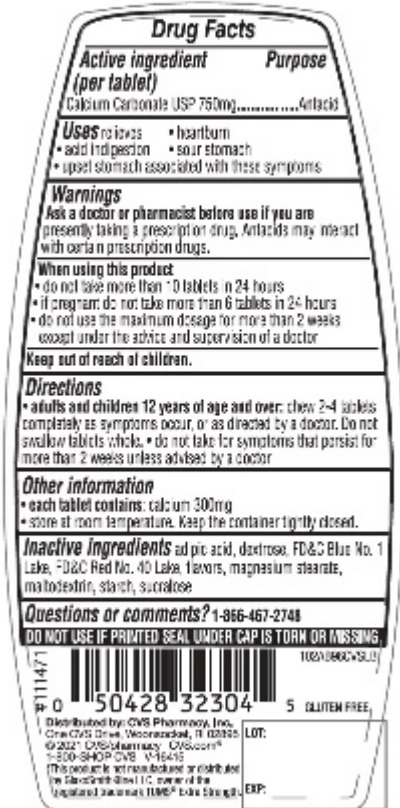
Package Label for 250 Chewable Tablets