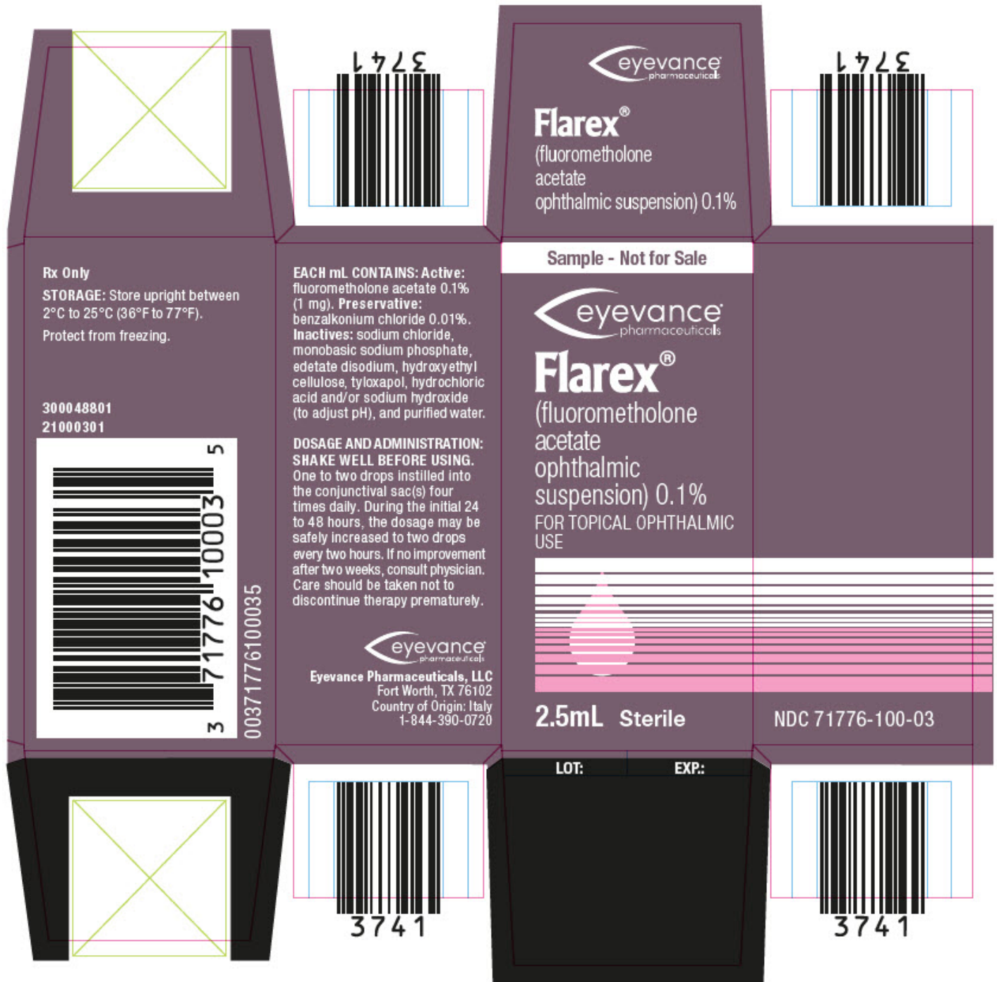
PRINCIPAL DISPLAY PANEL - 5 mL Bottle Carton