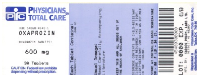
Oxaprozin tablets, USP, 600 mg