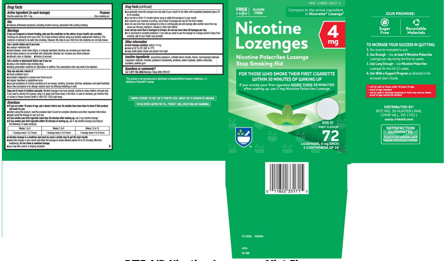
RITE AID Nicotine Lozenges Mint Flavor