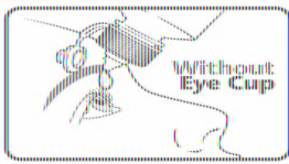
Without Eye Cup