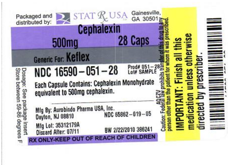
LABEL IMAGE FOR 500MG