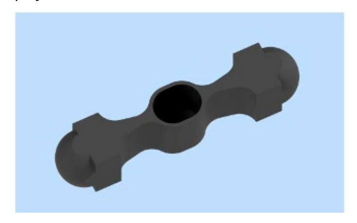
Table 3. Physical Dimensions of Crucible

TECHNEGAS (kit for the preparation of technetium Tc 99m-labeled carbon inhalation aerosol) is a 1.25 gram black to dark grey graphite carbon crucible (Technegas Crucible). Graphite is a polymorph of the element carbon, appears opaque, and crystallizes in the hexagonal system. The crucible has the following appearance and physical dimensions: