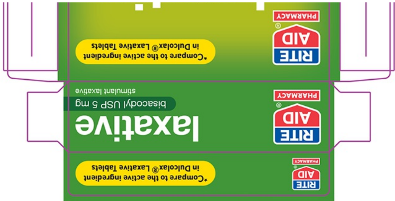
Rite Aid 44-327