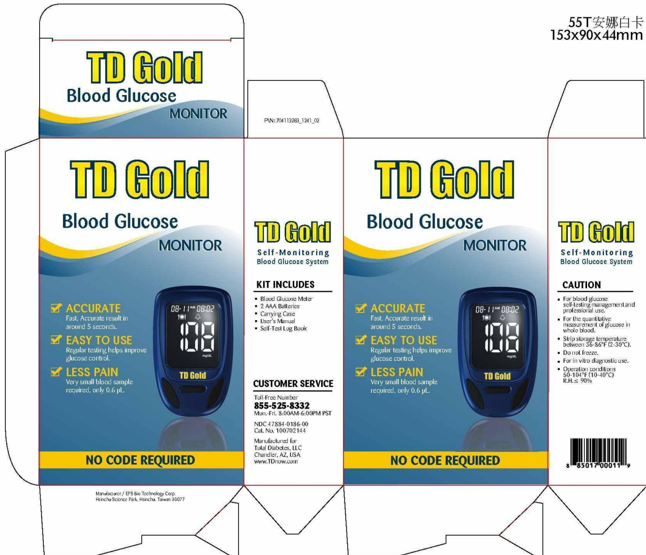
Diagram of TD Gold Blood Glucose Meter