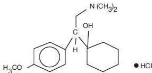
Venlafaxine hydrochloride Venlafaxine hydrochloride

Venlafaxine Extended Release Tablets (venlafaxine hydrochloride) are extended-release tablets for oral administration that contain venlafaxine hydrochloride, a structurally novel antidepressant. Venlafaxine hydrochloride is a selective serotonin and norepinephrine reuptake inhibitor (SNRI). It is designated (R/S)-1-[2-(dimethylamino)-1-(4-methoxyphenyl)ethyl] cyclohexanol hydrochloride or (±)-1-[α- [(dimethylamino)methyl]-p-methoxybenzyl] cyclohexanol hydrochloride and has the empirical formula of C_{17}H_{27}NO_2 \cdot HCl . Its molecular weight is 313.87. The structural formula is shown below.