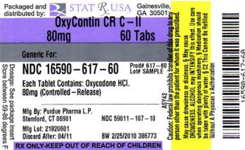
OXYCONTIN CR 80MG LABEL