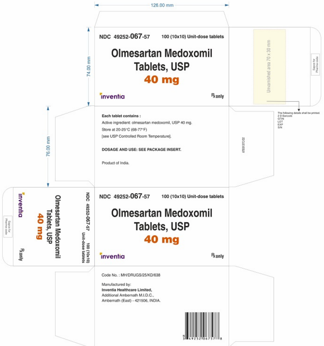
Olmesartan 40 mg Label (30 Counts)