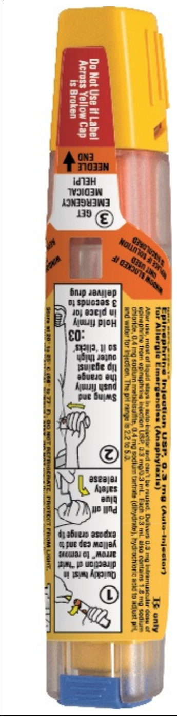
Epinephrine Injection 0.3 mg (Yellow)