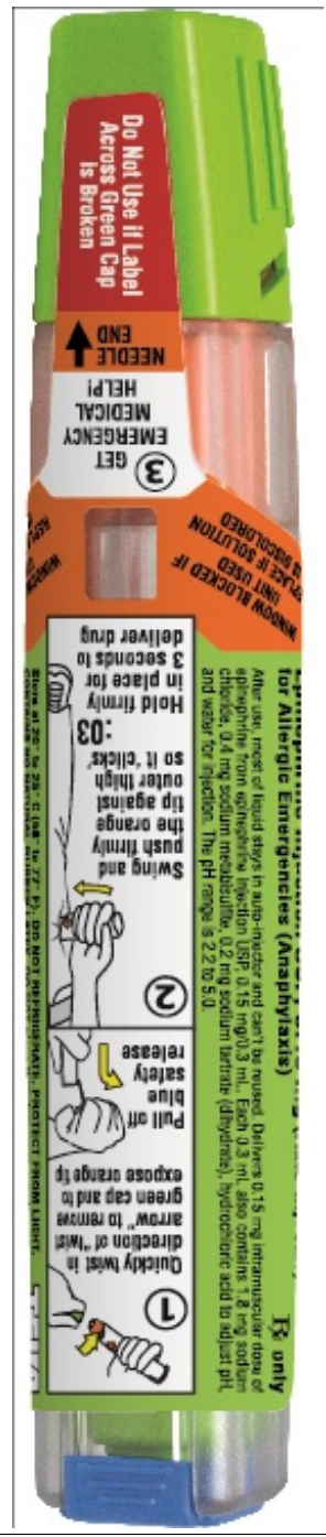
Epinephrine Injection 0.15 mg (Green)