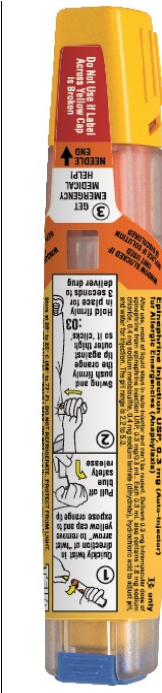
Epinephrine Injection 0.3 mg (Yellow)