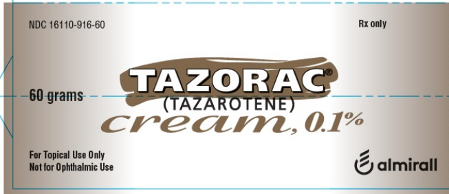
PRINCIPAL DISPLAY PANEL - NDC: 16110-916-60 - 60 grams 0.1% Carton Label