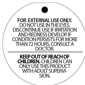
Page 2 (Front)