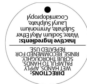
Page 2 (Back)