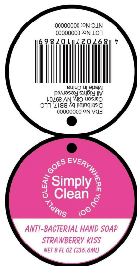
Page 1 (Front)

INACTIVE INGREDIENTS: Water, Sodium Alkyl Ether Sulphate, Ammonium Lauryl Sulphate, Cocamidopropyl Betaine, Cocamide DEA, Disodium Laureth Sulfosuccinate, Sodium Chloride, Glycol Distearate, Fragrance, Methylchloroiso-thiazolinone, Methylisothiazolinone, Citric Acid, Disodium EDTA, FD&C Red NO. 33