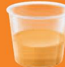
Dosing cup included

See back panel for full dosing directions.