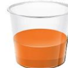
Dosing cup included

See back panel for full dosing directions.