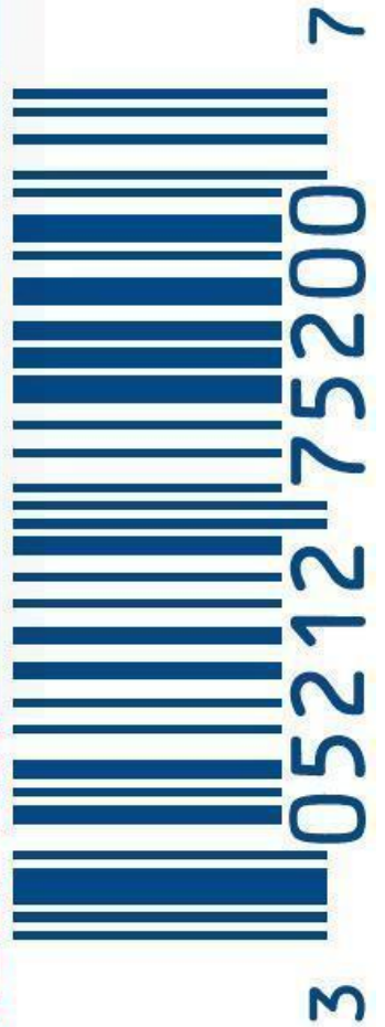
VLT Cherry Blister Card