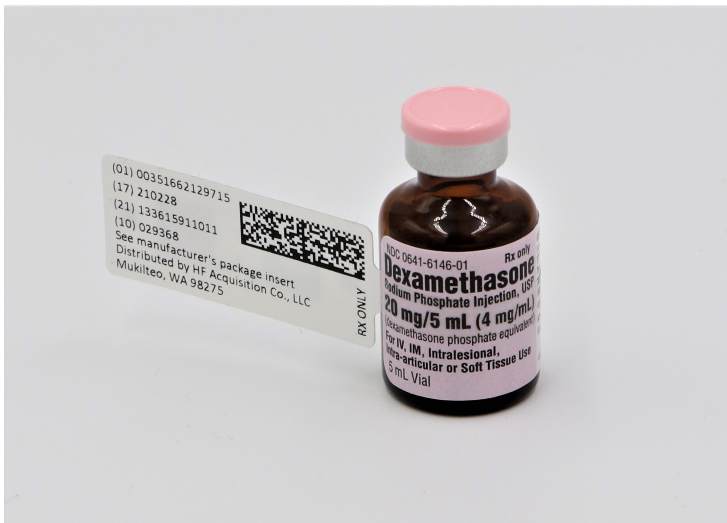
Principal Display Panel - 51662-1297-3 - Case Labeling