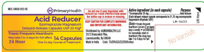
Top Ply (Page #1)