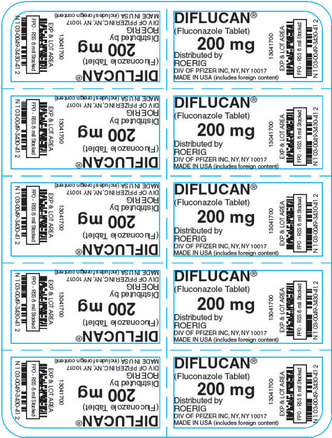
PRINCIPAL DISPLAY PANEL - 200 mg Tablet Blister Pack Carton UNIT DOSE