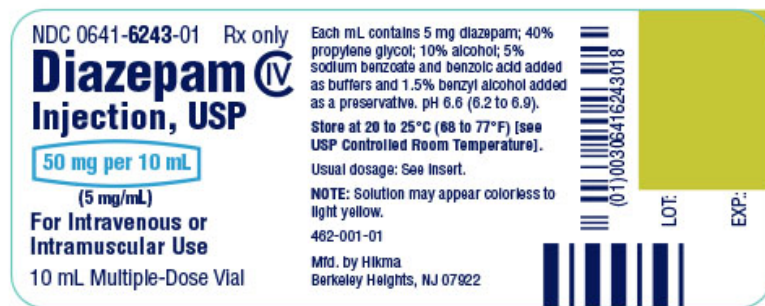
Diazepam Injection, USP 50 mg per 10 mL Container Label