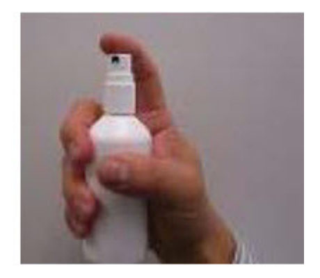
Step 3: Spray only enough Topicort Topical Spray to cover the affected area, for example, the elbow ( See Figure C ). Rub in Topicort Topical Spray gently to the affected area.