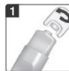
1. Twist off cap