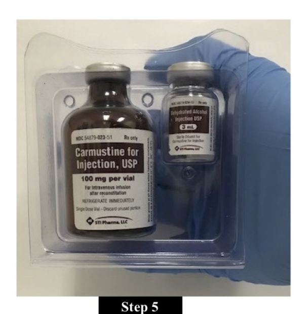
Hold the Product Kit guard by hand firmly and gently shake to dissolve the content