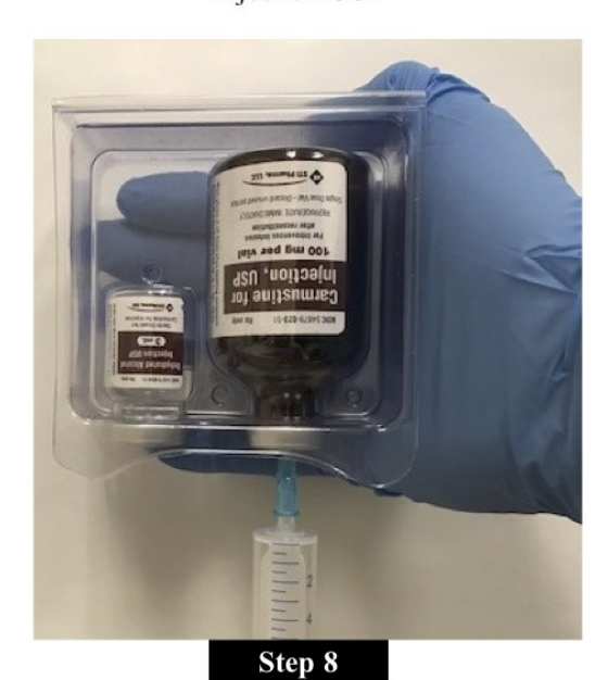
Aseptically remove the diluted product and infuse after further dilution as recommended with Sodium Chloride for Injection, USP or 5% Dextrose Injection, USP

Please refer to the product information leaflet before administration For more information call STI Pharma LLC at 1.888.301.9680 Manufactured for: STI Pharma LLC, Newtown, PA 18940