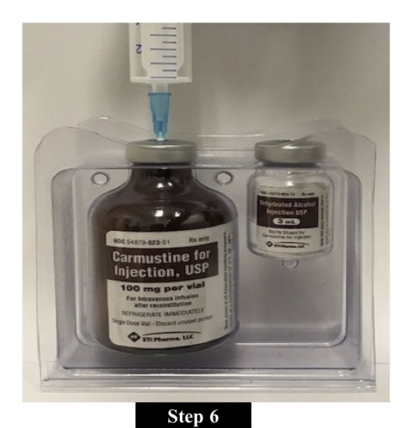
Aseptically add 27mL Sterile Water for Injection USP