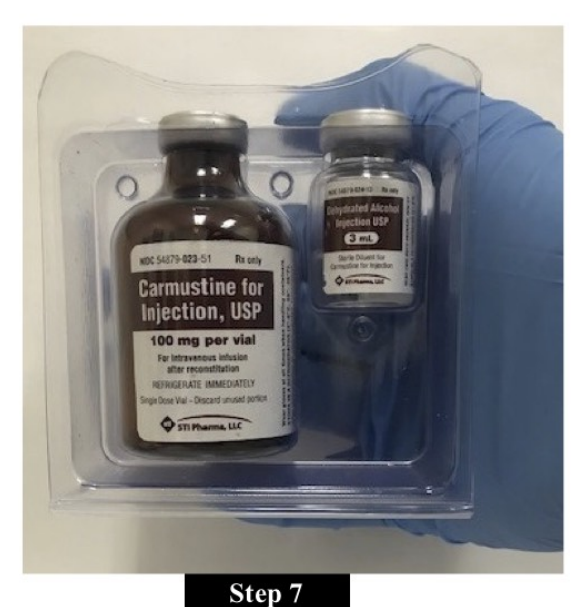
Hold the Product Kit guard by hand firmly and shake gently