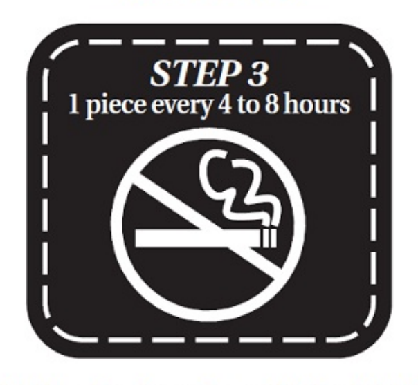
At the Beginning of Week #10