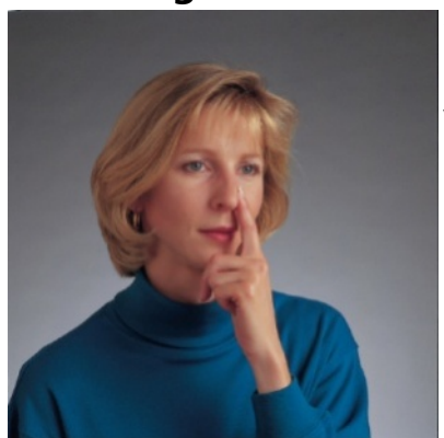
Step 3. Keeping your head in an upright position, gently close 1 nostril with your index finger and breathe out gently through your mouth (see Figure C).