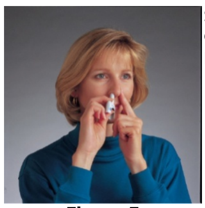
Step 5. Keep your head upright and close your mouth. While gently taking a breath in through your nose, press the blue plunger firmly to release the dose of IMITREX nasal spray (see Figure E).