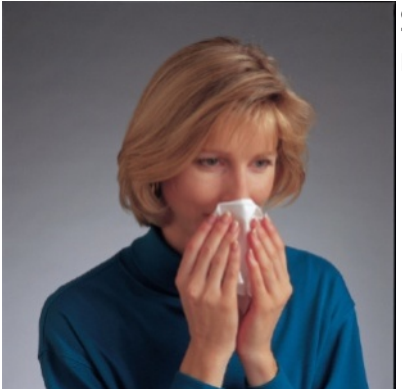
Step 2. While sitting down, gently blow your nose to clear your nasal passages (see Figure B).