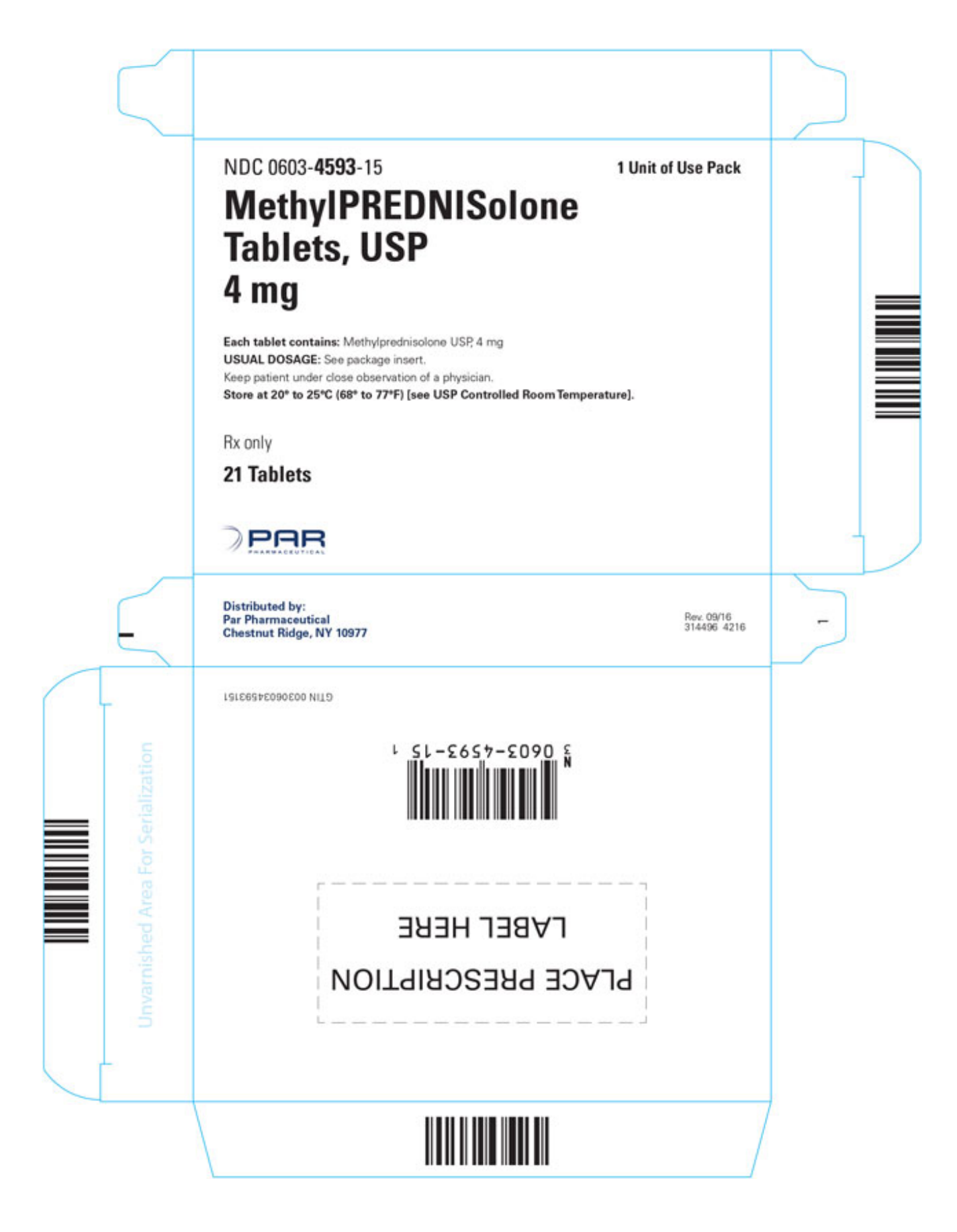
PRINCIPAL DISPLAY PANEL