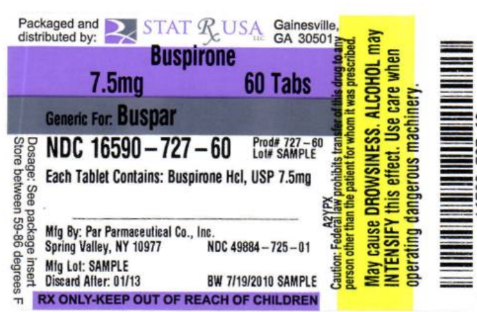
BUSPIRONE 7.5MG LABEL IMAGE

Store at 25°C (77°F); excursions permitted between 15°C to 30°C (59°F to 86°F) [see USP controlled room temperature]