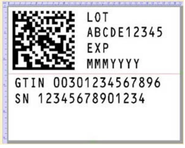
Representative Carton Serialization Image