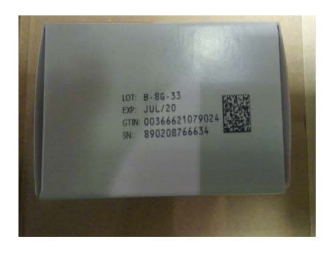
Anavip Vial label