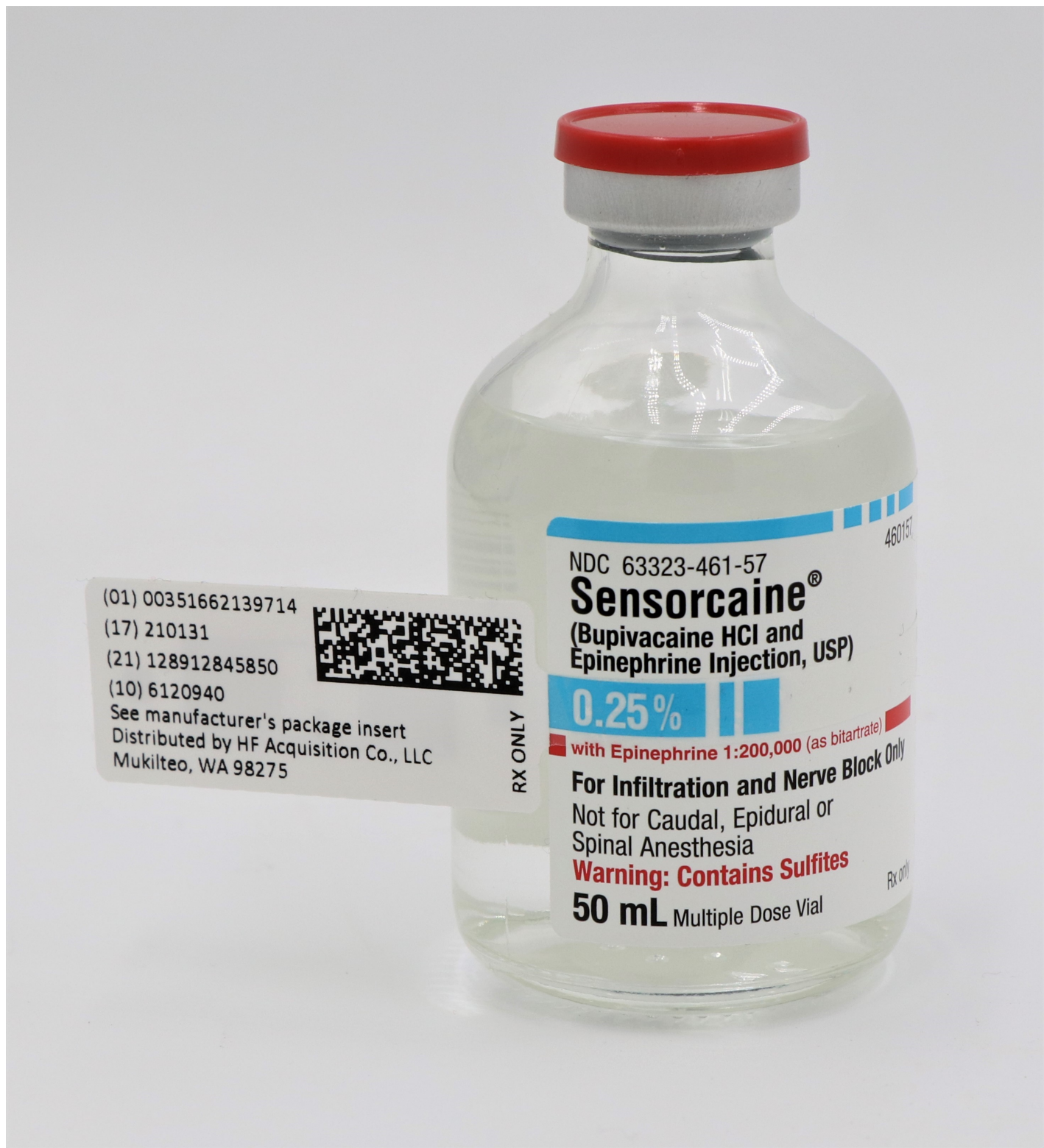
Principal Display Panel-Pouch Labeling 51662-1397-2