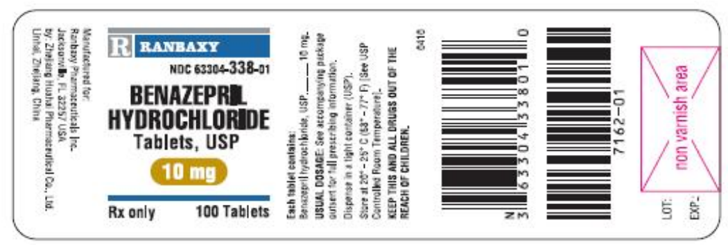
Bottle Label 10 mg 100's