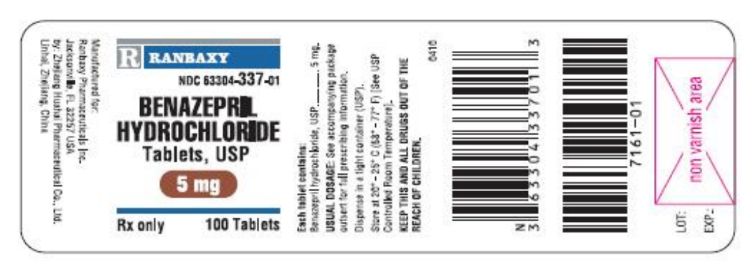
Bottle Label 5 mg 100's