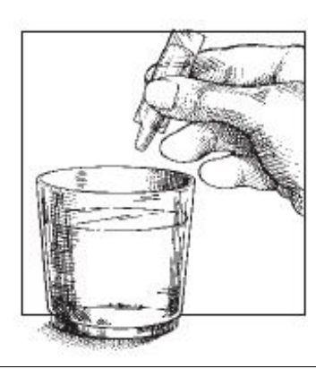
4. Squeeze liquid contents into a glass of water. Stir solution. Drink all of the liquid. Discard the empty ampule.

3. Open the ampule by twisting off the tabbed top section.